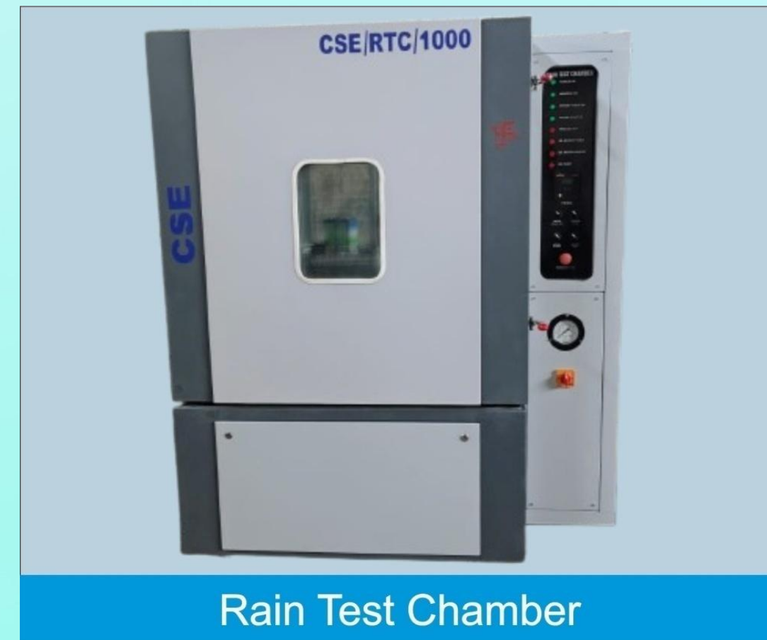
Rain Test Chamber

***All above specification can be very as per customer requirement.