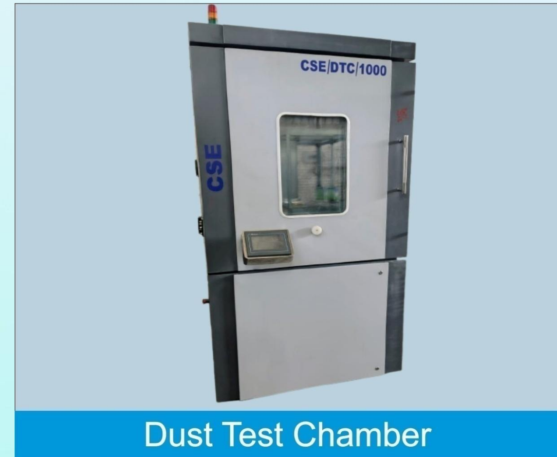
Dust Test Chamber