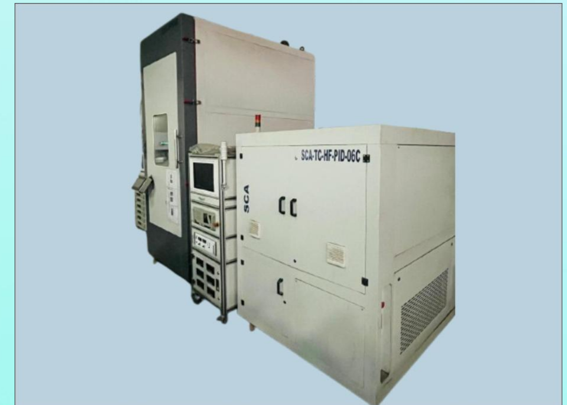
Environmental Test Chamber for Solar Module Test