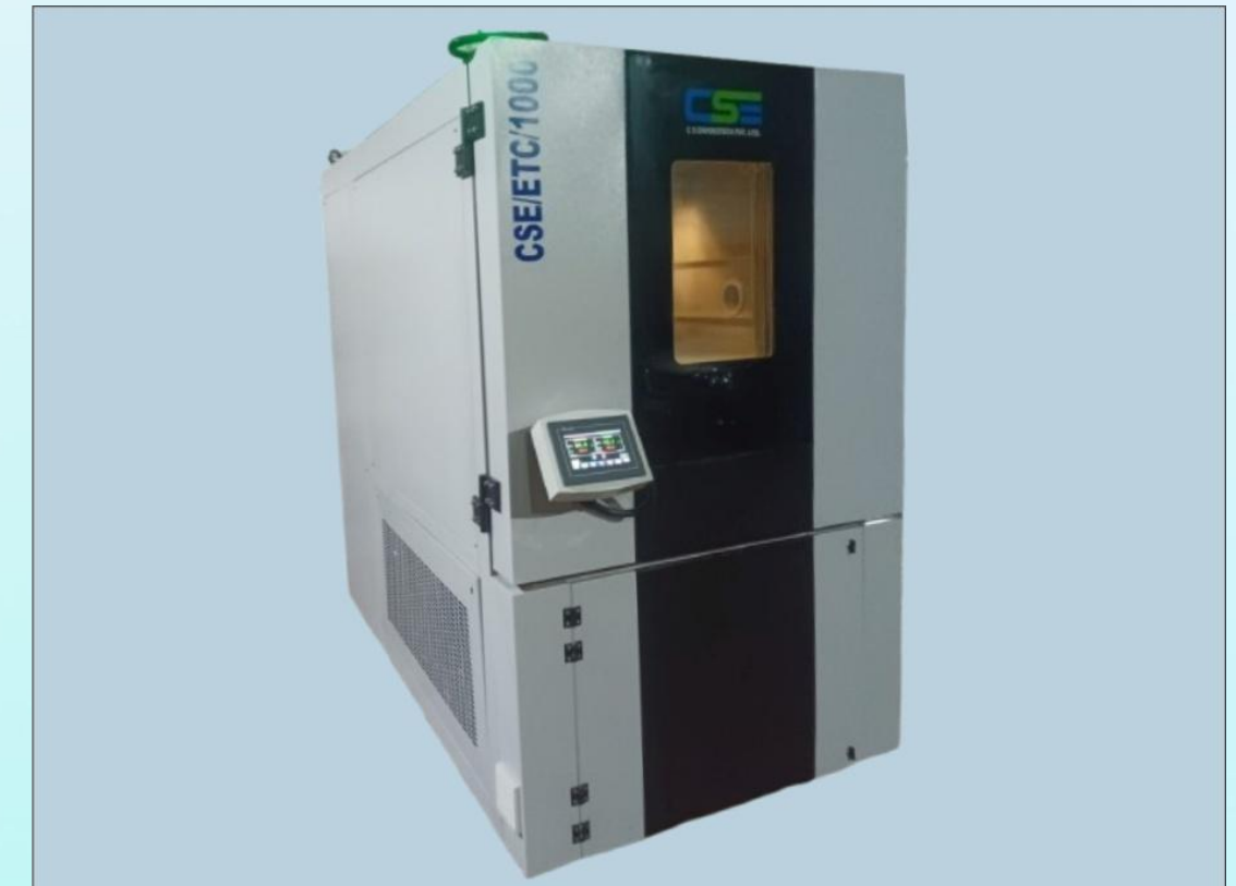
Environmental Test Chamner

***All above specification can be very as per customer requirement.