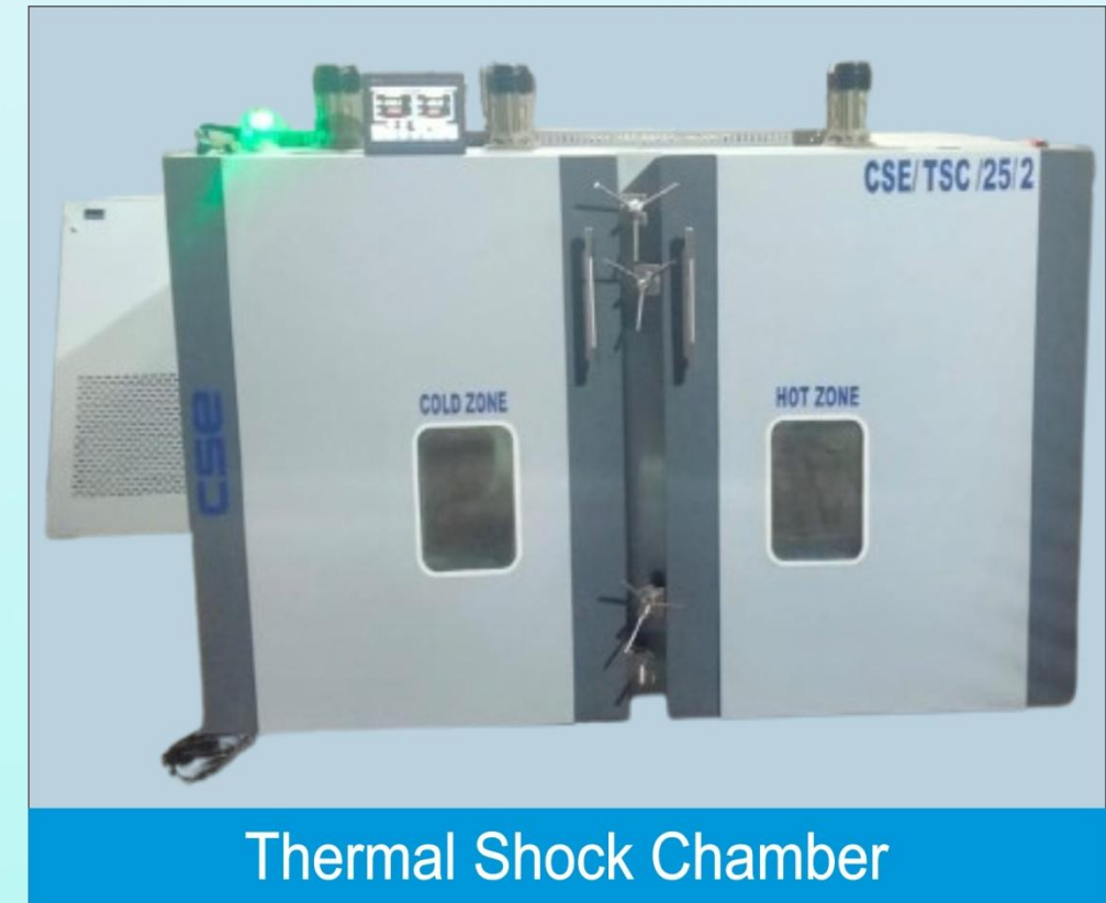
Thermal Shock Chamber

***All above specification can be very as per customer requirement.